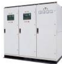
DSE-550 Parallel Control Panel system