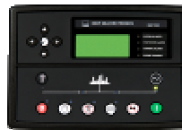
DSE-7320 Remote Control Panel